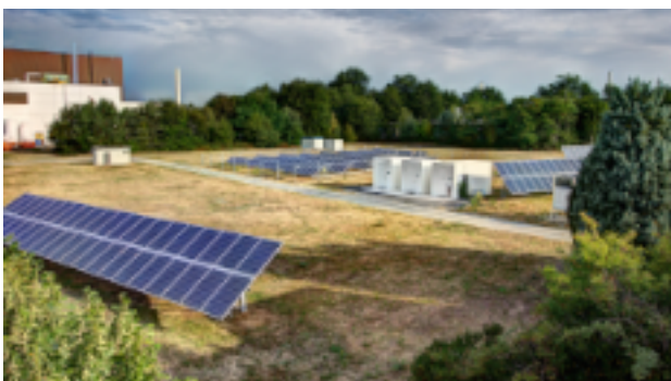
PV facility with Lithium-ion storage system

In 2012, scientists of KIT thought about how to reasonably use regenerative energy sources and sustainably integrate them in its energy concept. They came up with the idea of covering part of the high energy consumption of Campus North by solar power produced by its own PV facility. Then, it was quite logical to launch a parallel project to study the interaction of solar modules, power inverters and lithium-ion batteries. The PV facility was installed in 2013 and since then, all solar power generated has been used to operate large-scale research infrastructure on Campus North. The facility is not only used to cover own power consumption, but also to conduct research. It has been integrated into the Energy Lab 2.0 and provides valuable data for different simulations and evaluations.