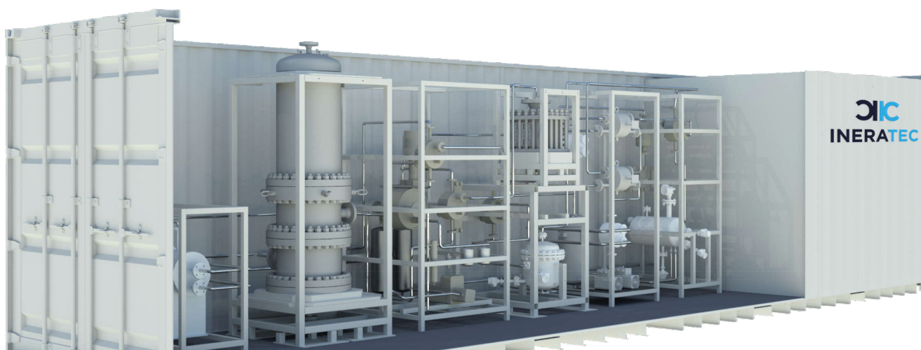
Simplified representation of the E-fuel synthesis plant

In order to increase the yield of the desired liquid product and optimize the fuel properties, the containerized synthesis plant features a product upgrade step.