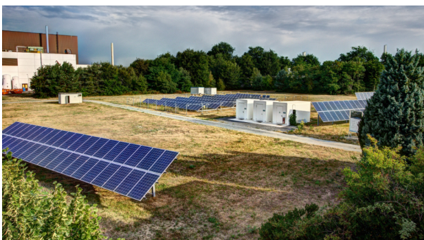
PV facility with Lithium-ion storage system

In 2012, scientists of KIT thought about how to reasonably use regenerative energy sources and sustainably integrate them in its energy concept. They came up with the idea of covering part of the high energy consumption of Campus North by solar power produced by its own PV facility. Then, it was quite logical to launch a parallel project to study the interaction of solar modules, power inverters and lithium-ion batteries. The PV facility was installed in 2013 and since then, all solar power generated has been used to operate large-scale research infrastructure on Campus North. The facility is not only used to cover own power consumption, but also to conduct research. It has been integrated into the Energy Lab 2.0 and provides valuable data for different simulations and evaluations.